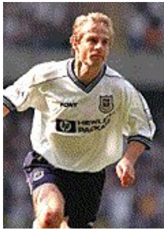
Figure 1: A very fine footballer